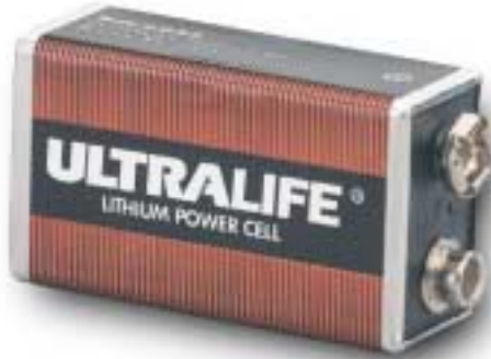
Dimensions in mm (inches)